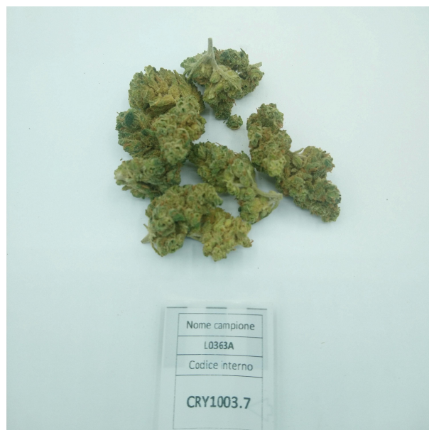
ANALYSIERTE PROBE: Finola(3.00gr)